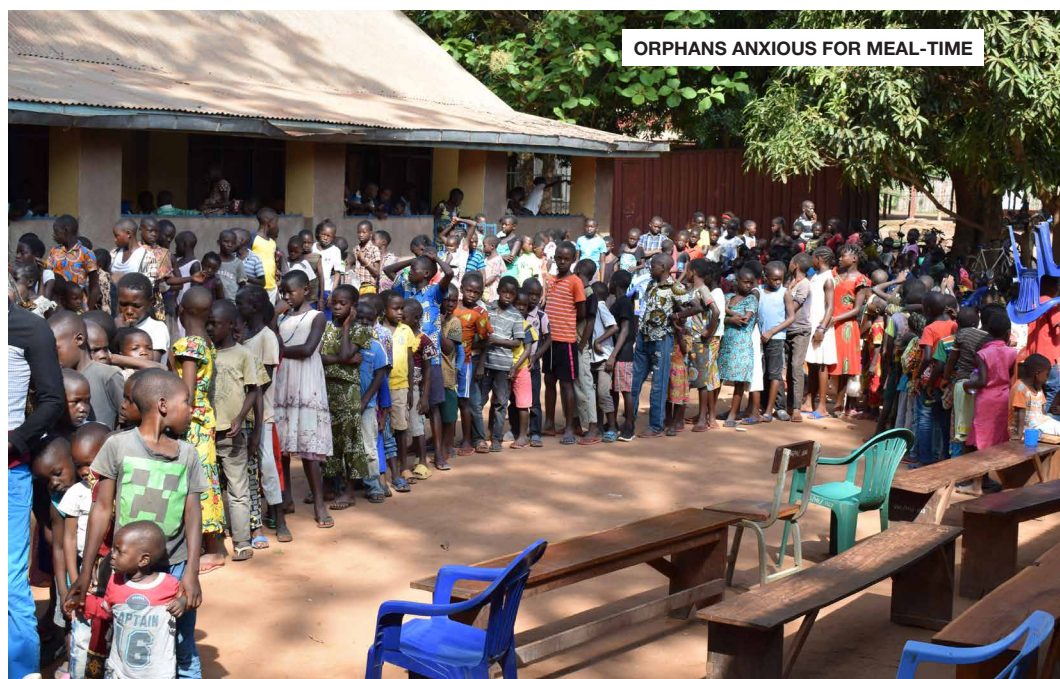
ORPHANS ANXIOUS FOR MEAL-TIME

In 2019, he has worked extra hard and was able to clear the loan for his machine. In June he exited the program and managed to rent his own shop outside Ruben Centre and has employed two people, one of whom is a former classmate.