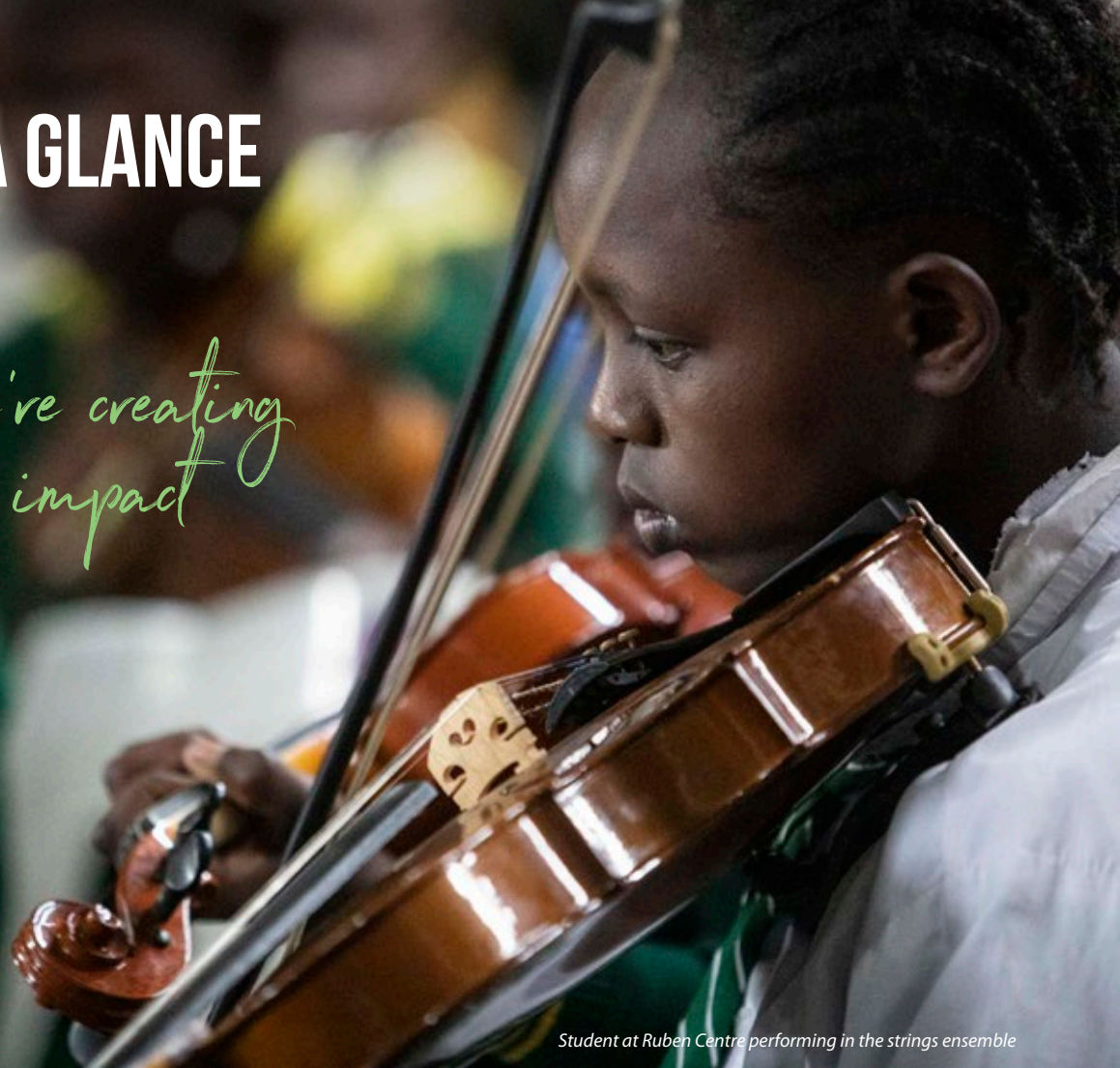
Student at Ruben Centre performing in the strings ensemble