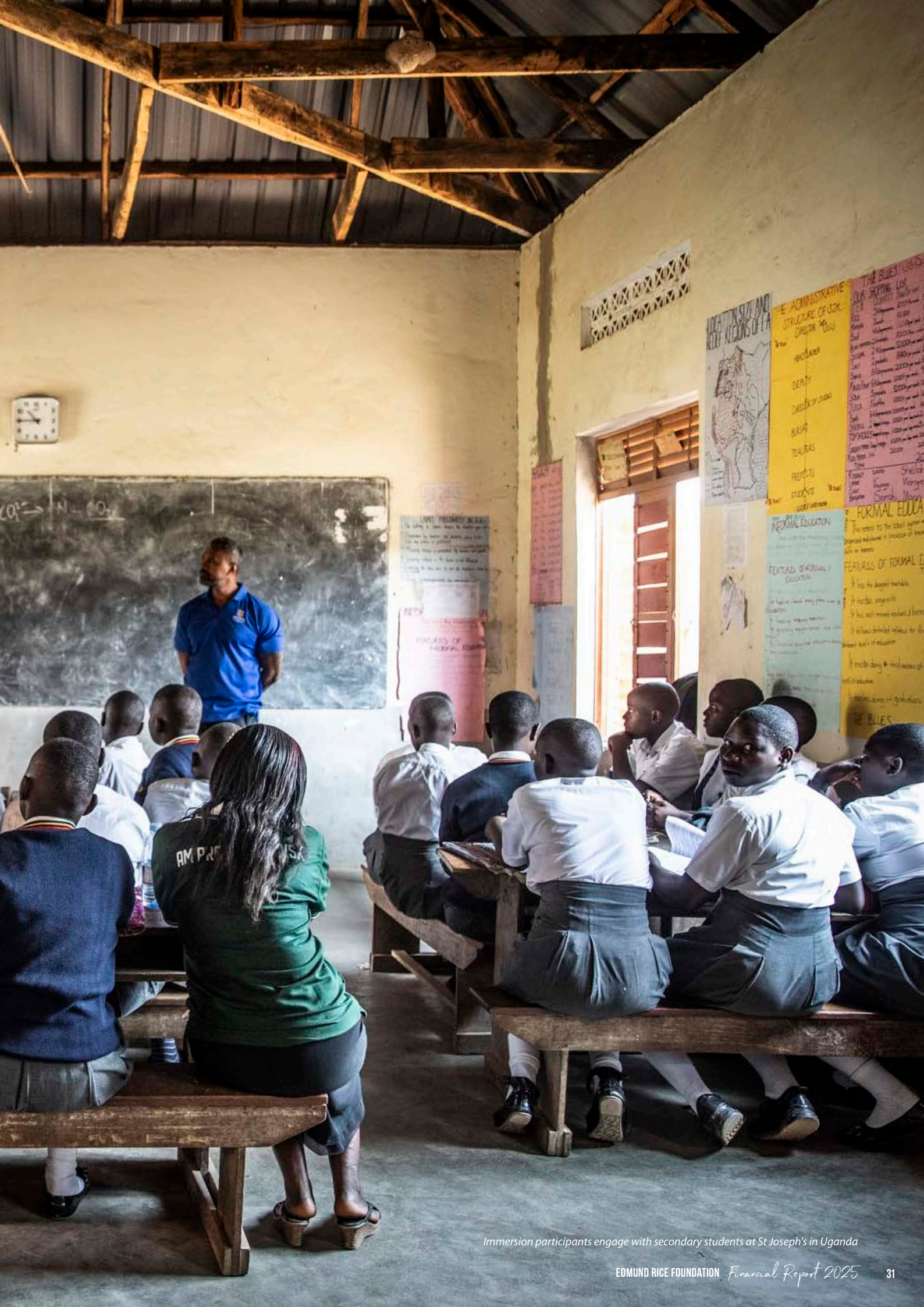
Immersion participants engage with secondary students at St Joseph's in Uganda